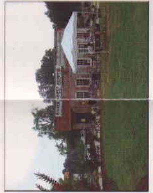
Bicycles for rent at Silver Comet Depot.