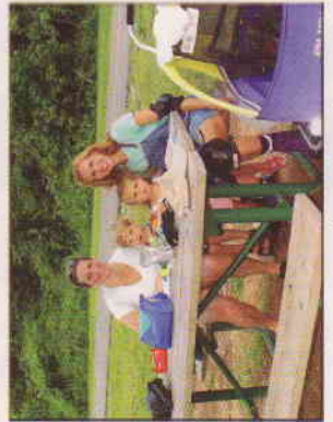
Enjoying a picnic along the trail.