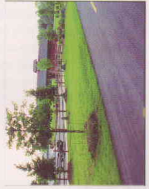
One of the four trailheads.