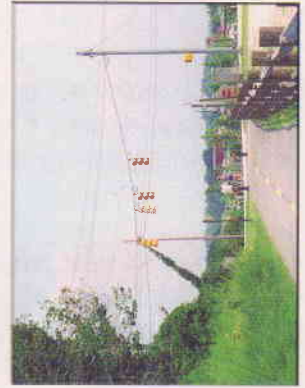
Silver Comet/Florence Rd. intersection.