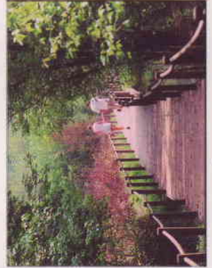
Heritage Park Trail connects to Silver Comet.