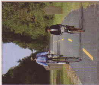
Cycling is a popular activity.